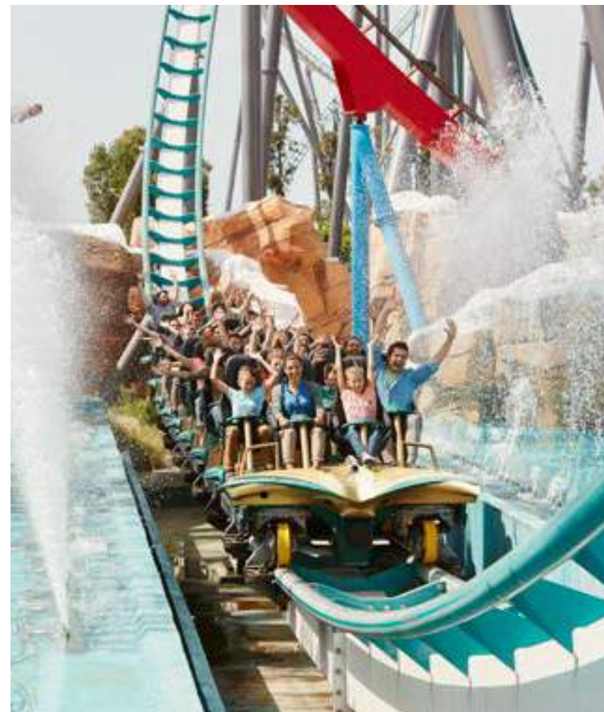
The Dragon Khan , the Furius Baco and the Shambhala are the three star rollercoasters of the park.

The shows are one of the great attractions of PortAventura Park.